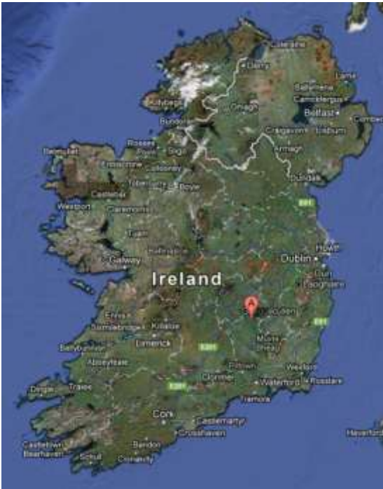
Castlecomer, Co. Kilkenny, Ireland